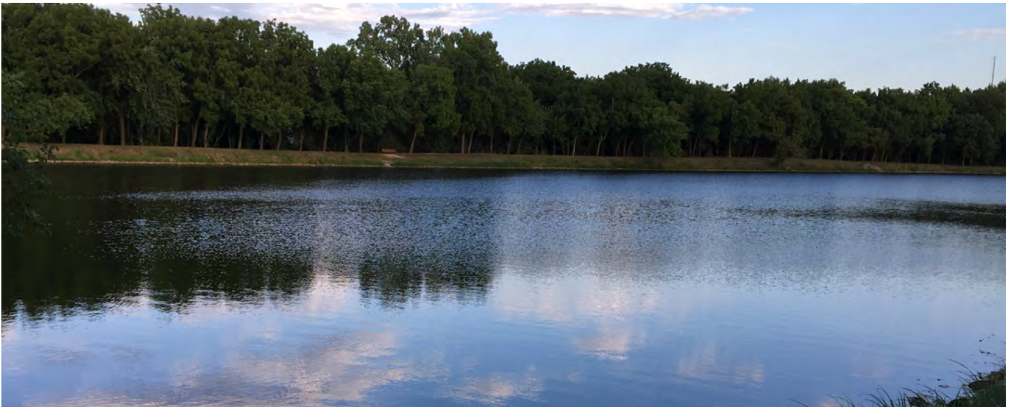
Lake Olathe in Kansas

the dissolved oxygen concentration. This nutrient-rich condition, known as eutrophication, occurs in lakes and reservoirs all over the world, often leading to algal blooms, taste and odor issues, reduction in fish populations, and ultimately the elimination of the water body as a resource to the community.