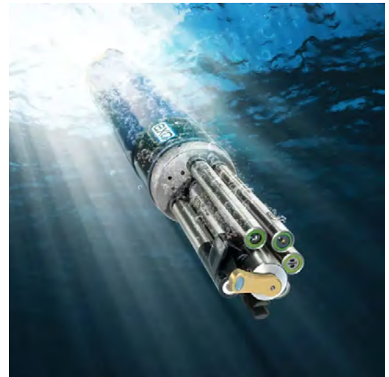
EXO2 Multiparameter Sonde

The system is extremely robust for the long-term, unattended monitoring due to the EXO anti-fouling wiper. This sonde has remained deployed for up to 80 days without compromises in data quality. This is particularly useful in water resources with active levels of algae.